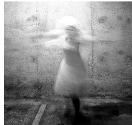
EXT: Blurred movement