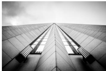
2. Worms Eye View