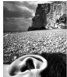
4. Unusual angle