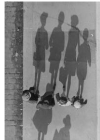
3. Birds eye view