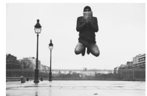
EXT: Frozen movement